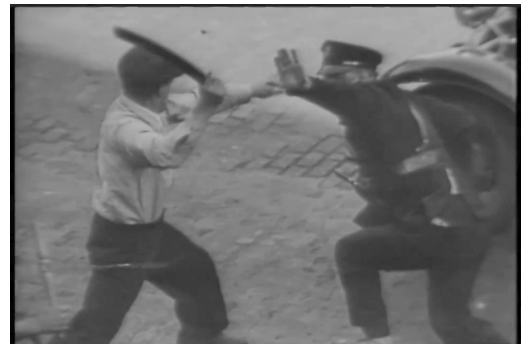
Labor's gotta play hardball to win! Scene of the "Battle of Deputies Run" from Labor's Turning Point .

Protesters chant "black lives matter" as police continue to kill hundreds of African Americans with impunity every year. Low-wage workers demand $15 an hour, still a poverty wage. Dock workers locked out, teachers threatened with arbitrary dismissal, 400,000+ immigrants deported yearly: this is Wall Street's America today. The same Democratic and Republican parties that brutalize and jail black youth, break up immigrant families and wage imperialist wars around the world are on a warpath against the unions. Yet labor misleaders give up without a fight. Only the multiracial working class has the power to go beyond symbolic protests and shut down the capitalist system of racist cop violence, union-busting and immigrant-bashing . For that we need to build a leadership with a program and the determination to take on and defeat the bosses and their state. An example of how to do that was the Minneapolis Teamster strike of 1934. CSWP seeks to organize a core of worker-activists to oust the labor bureaucrats, break with the Democrats and all the bosses' parties, and fight for a workers government. Join us for a film showing and discussion of what it will take to transform the unions into genuine defenders of all workers and the oppressed.